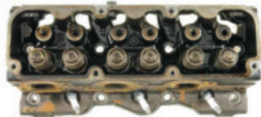
Cylinder head pre-cleanup. Note the sludge deposits on and around the valve springs and push rod openings.

NOTE: It is not recommended to flush transmissions that do not have a removable pan or access to the transmission filter.