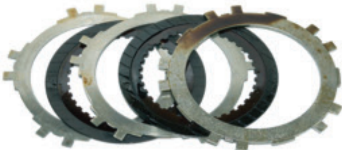
Automatic transmission clutch plates after cleanup with AMSOIL Engine and Transmission Flush reveal lighter glazing and varnish.