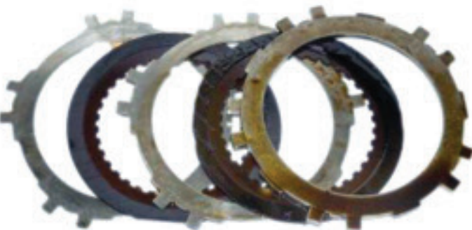
Automatic transmission clutch plates pre-cleanup. Varnish and glazing is heavy on some of the plates.